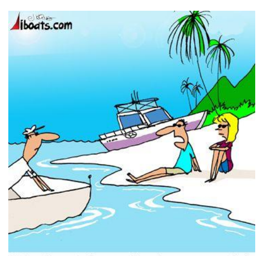
"Our boat is fine, and we're not stranded. We just don't want to go back to that crazy world."