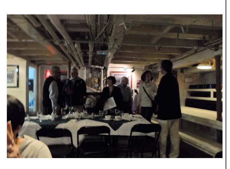
Instructors thank you dinner aboard the HMCS Sackville