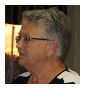
Commander's Corner April, 2012