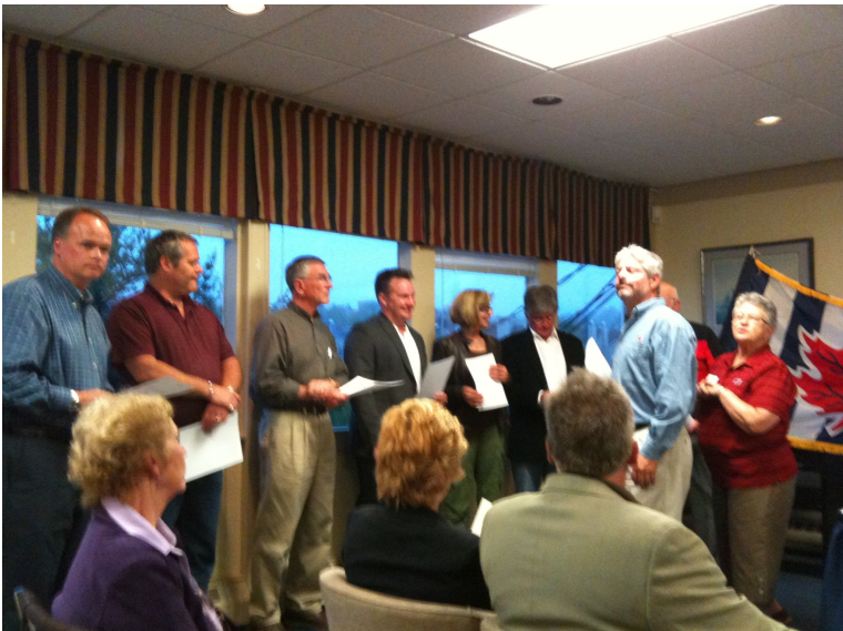
Proud Graduates from June 2010