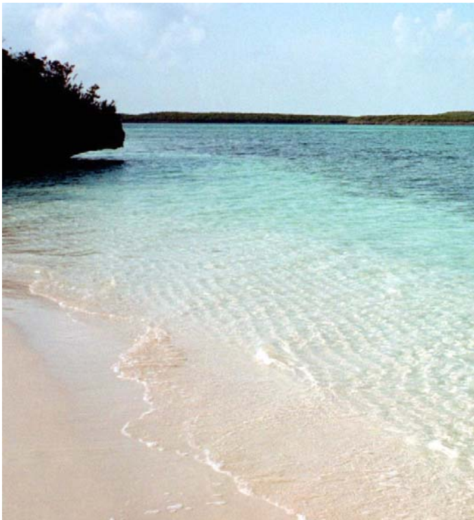
A private beach at Devil's-Hoffman Cays

OK, today the wind is down. Some boats are leaving already. We'll wait a day for the seas to subside & spend time getting set to sail North 40 nm to the Berry Islands (a.k.a., "The Berries") and Devil's-Hoffman Cays for a few days. Hopefully that will allow the wind to go a little more to the East. From there we hope to go up to Stirrup Cay on the North tip of the Berries. There's another front coming already so we want to be secure for it.